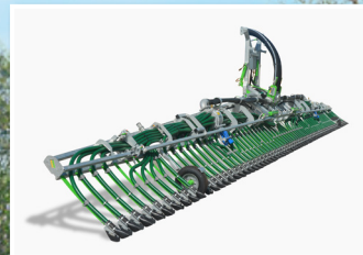
PENDISLIDE PRO 120/48PS2 line spreading boom