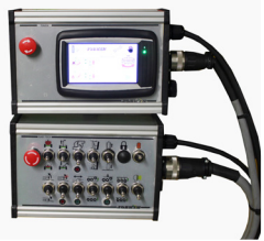
Electrohydraulic control with Touch-Control

AVAILABLE AND DELIVERABLE IN THE SHORT TERM!